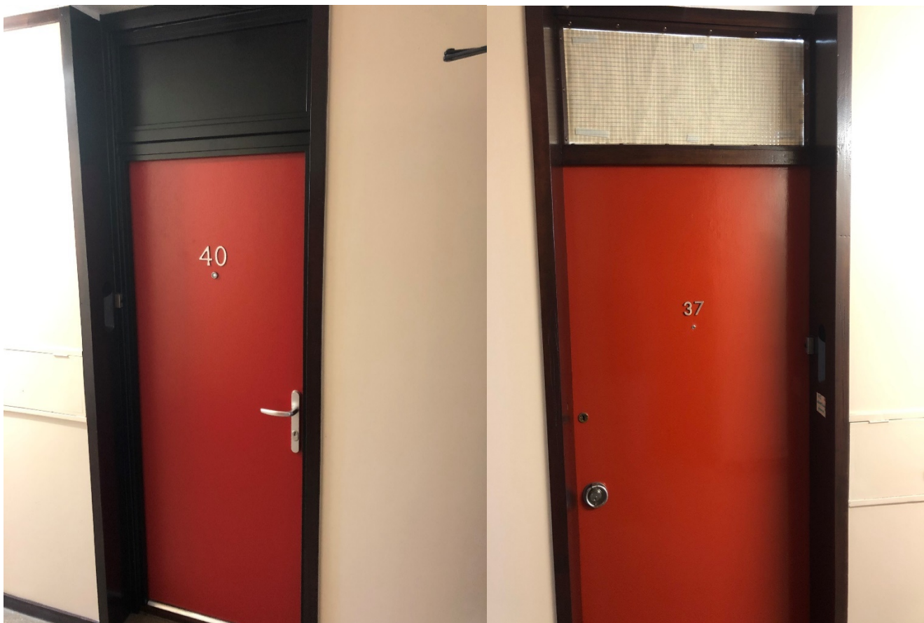
New temporary door

I would welcome any feedback from residents in Great Arthur House on the door please. If I get inundated with emails, please bear with me as it may take me a little longer to respond (if a response is required).